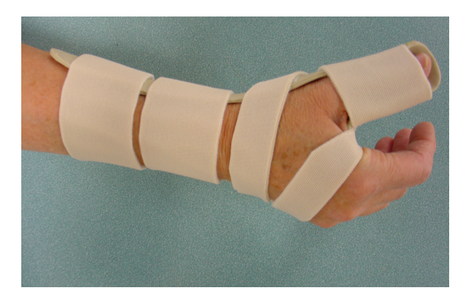
Example of a custom orthosis that can be fabricated to protect the tendon transfer until healed

The purpose of the surgery is to restore lost movement. The healing process can take up to one year to gain maximum results. The new tendon is not as strong as the original, but it can restore motion and function to allow patients to return to daily activities.