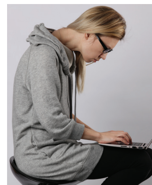
Poor posture and work setup can compress blood vessels and nerves.

Additionally, a home symptom management program will be developed to include stretches, nerve motion and strengthening.